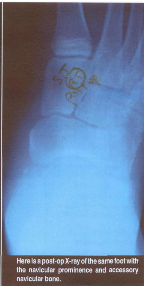
Here is a post-op X-ray of the same foot with the navicular prominence and accessory navicular bone.

ening the posterior tibial tendon to plantar soft tissues, including the plantar talo-navicular spring ligament.