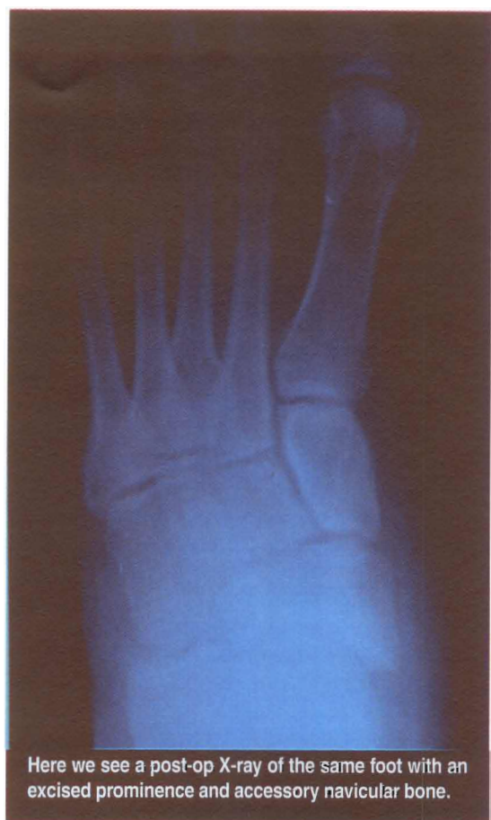
Here we see a post-op X-ray of the same foot with an excised prominence and accessory navicular bone.

trophied navicular bone, you may notice redundant posterior tibial tendon. In addition, when you're treating severe flatfoot cases or patients with inherent ligamentous laxity, be aware of excessive laxity of the posterior tibial tendon. It is important to check the redundancy or laxity of the tendon with the foot held in subtalar joint (STJ) neutral position. In these cases, you should perform tendon advancement.